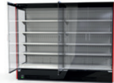
Evolution Integral Refrigeration Unit