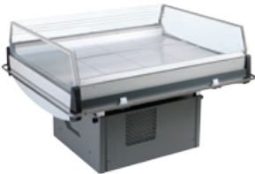
Grab 'n' Go Freezers to Chillers