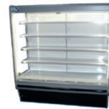
Multideck Display Cabinets